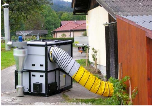
Fig. 5 – Heating of buildings with a biomass (wood chips) mobile air unit

An application concerning heating of buildings is presented in the Fig. 5: