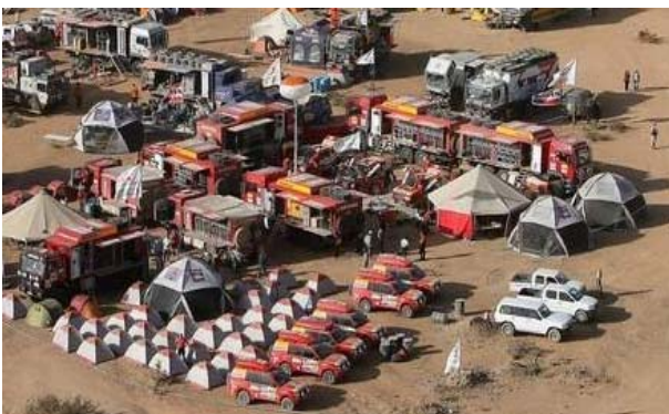
Fig. 6 – Heating of mobile automotive maintenance facility (rally camp)

The heating of a mobile maintenance service unit can be another application which could be done (Fig. 6). That can be placed somewhere around the world. That is why it is important to have as much as possible a relative fuel autonomy. In many cases wood chips can be provided in huge amounts and at a small price.