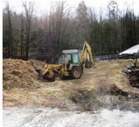
Fig. 7 – Simplicity and efficiency of the wood chip supply chain: tractor delivering

The supply chain of the wood chips can be easily organised as compared to other fuels. For example, a mobile unit can get supplies by also using a tractor (Fig. 7):