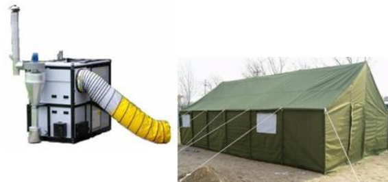
Fig. 8 – Heating of mobile military tent

Military application – It is known that military exercises take place in various areas, far away from the civilised area. In this case, fuel autonomy can be very useful and environmentally friendly. Fig. 8 shows a tent heating unit (outdoor):