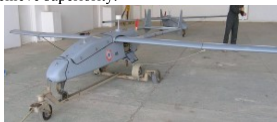
Fig. 1 UAV Shadow 600

In times of crisis or hostility the timely acquisition of the others side’s Order of Battle and position is paramount if one wishes to achieve superiority.