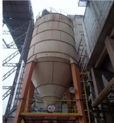
Fig. 2. Storage silo

The technical characteristics of storage silo are: vertical cylinder is made of sheet 5 mm, with a diameter of 6000mm and height of 7800mm, cylinder is composed of sections fixed with bolts. The cone trunk are 4300mm height, and is located at the bottom of the cylinder. structure is supported on four metal legs with caisson section.